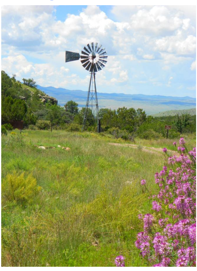
We hope that this summer will be as nice as 2014.