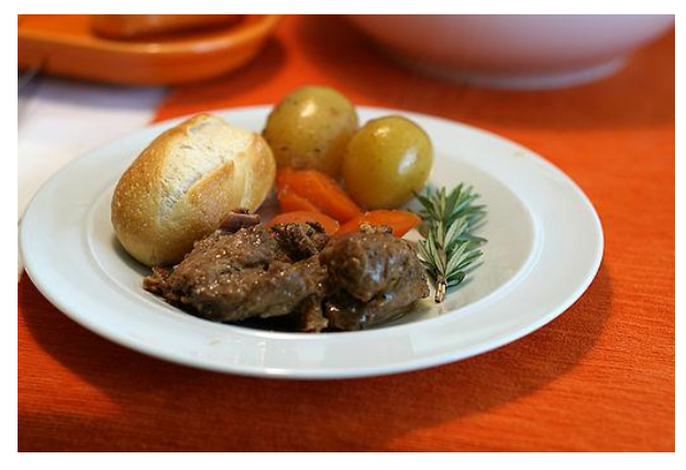
Roast Lamb w/ Potatoes

We will still be practicing targeted grazing with shepherds, dogs, and horses in order to maintain the health of the land, but for the first time in a long time, large portions of our land need extra grazing.